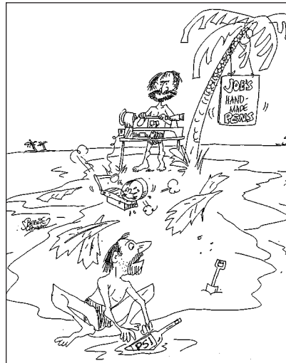
"Down to our last tree? That's OK, I'll place Super Blanks on our next order!"

more precise. However, we believe the elegance of the completed product is well worth the extra effort. (We'll devote a column to acrylics in a future issue of "The Penrafter.")