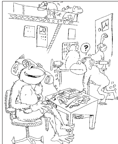
"Yes Sir, we know a lot about tropical woods here."

patience when sanding using successive grits of sandpaper. Using Penn State Industries turner's 'power wool'