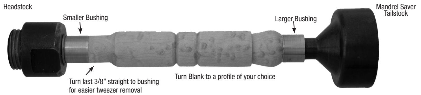
DIAGRAM B / TURNING THE BLANK