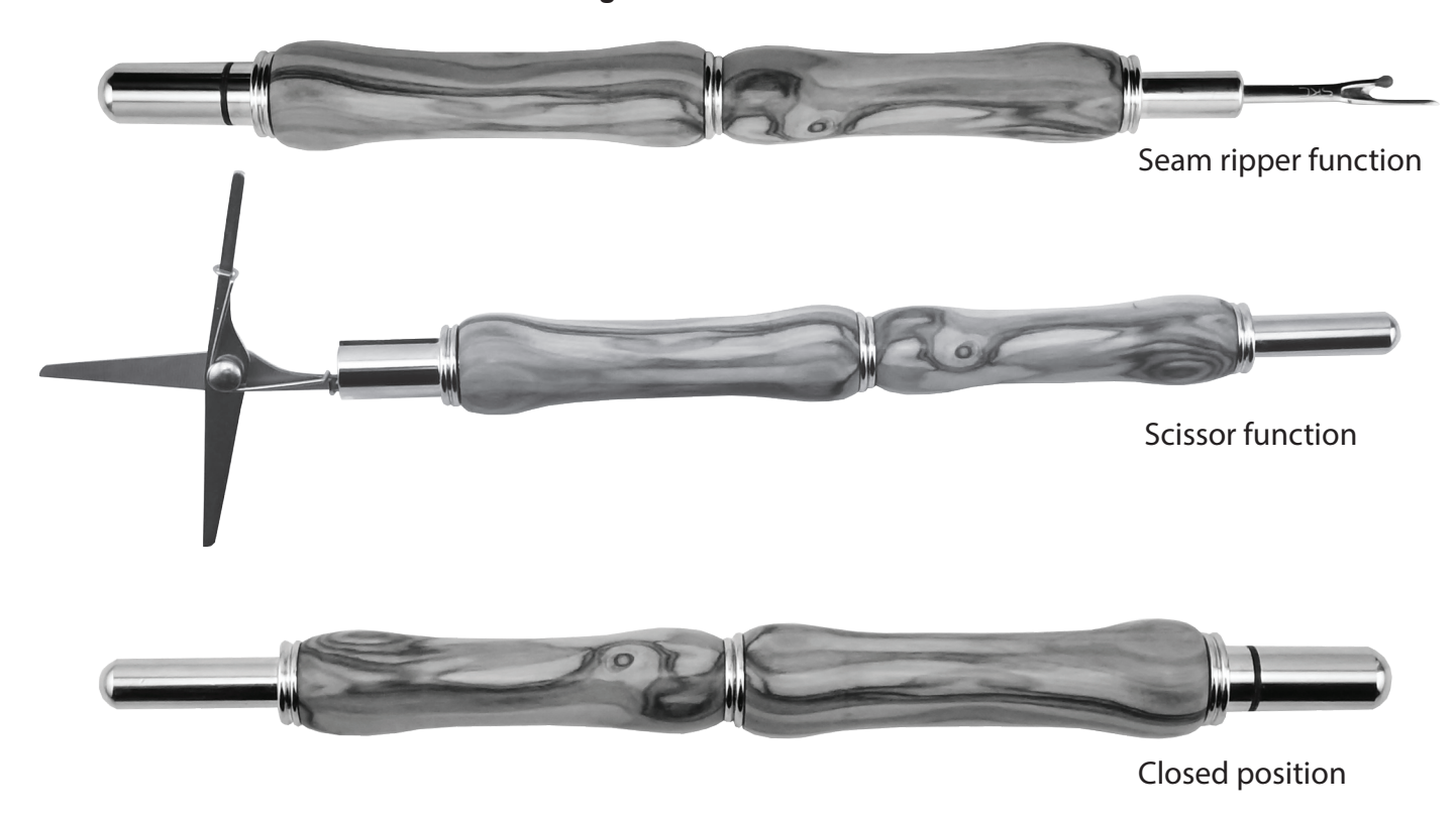
Diagram E / Tool Positions