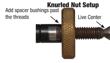
Diagram C / Bushing #PKSRSBU