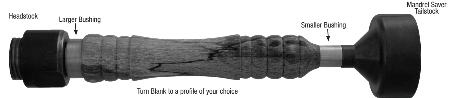
DIAGRAM B / TURNING THE BLANK

cutting head (#PKTRIM734) or a pen blank squaring jig on a disc sander. Take the excess material down flush to the ends of the tubes. Do not trim past the end of the tube since this may interfere with assembly. Use a barrel trimmer to clean the inside of the tube.