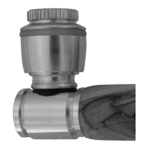
Diagram F Straight Orientation