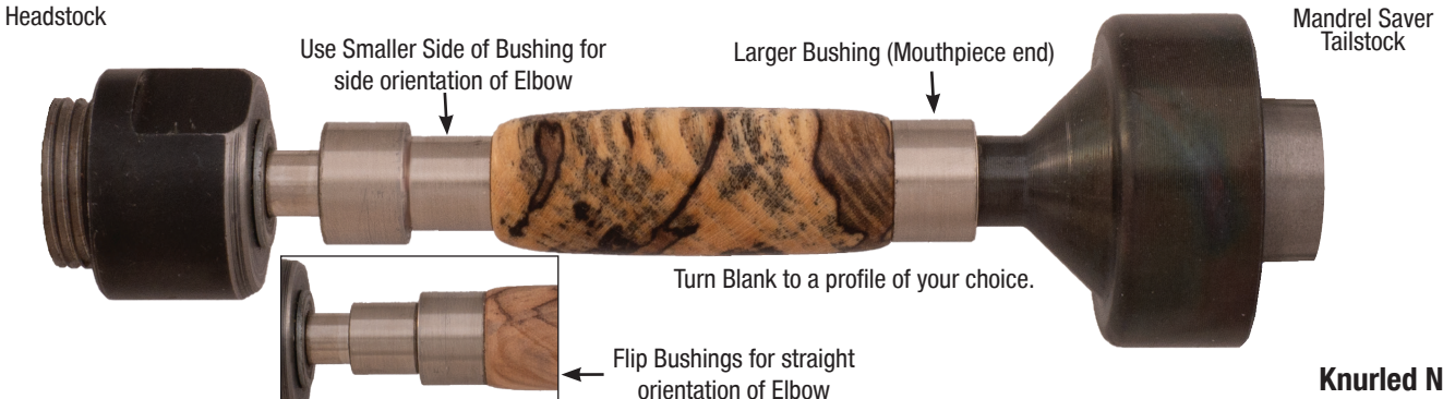
DIAGRAM B / TURNING THE BLANK