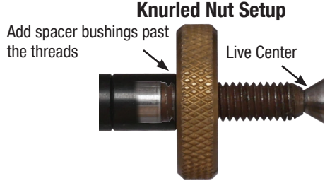
Diagram C / Bushing #PKSPIPEBU