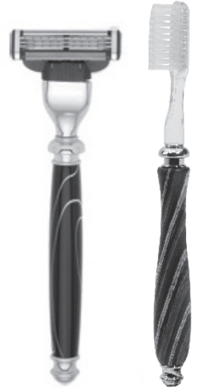
DIAGRAM A / PARTS LIST