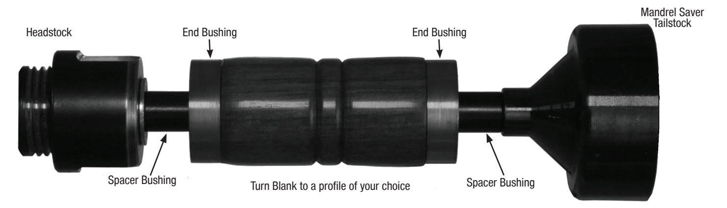
DIAGRAM B / TURNING THE BLANK