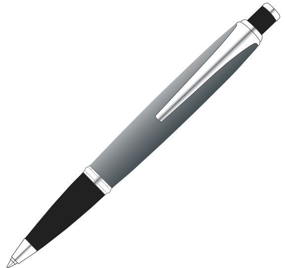
DIAGRAM A / PARTS LAYOUT