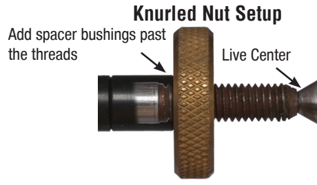
Diagram C / Bushing #PKIPICKBU