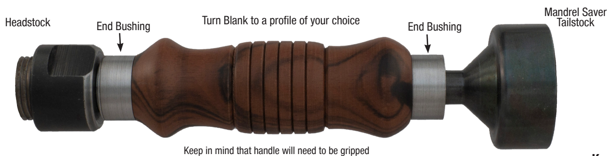
DIAGRAM B / TURNING THE BLANK