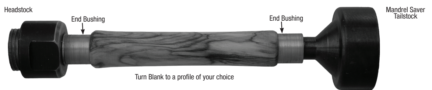
DIAGRAM B / TURNING THE BLANK