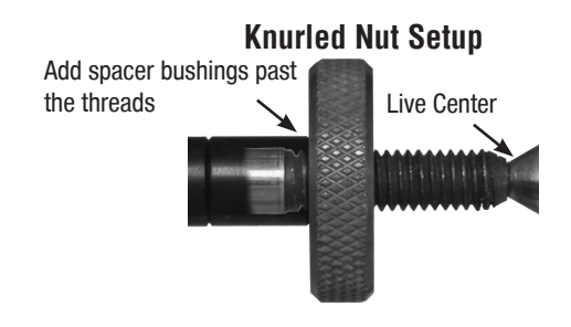
Diagram C / Bushing #PKFIDBBU