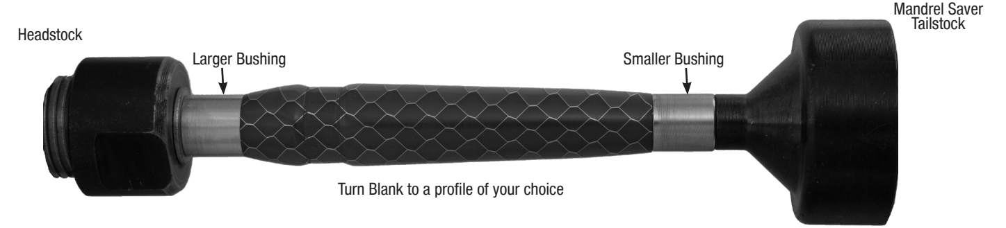
DIAGRAM B / TURNING THE BLANK