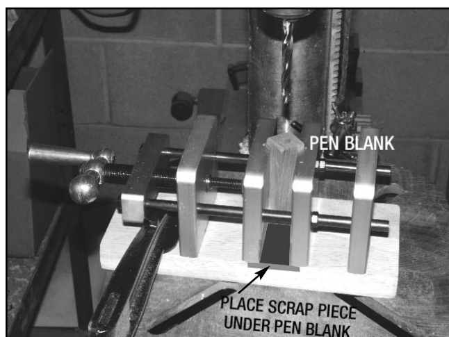
Drilling the Blank

You have just received an improved and more efficient pen blank drilling vise available. Correctly used, our vise will consistently position your wood blank flawlessly for drilling holes through the exact center. The blanks can be any shape and be a maximum width of 2-1/4".