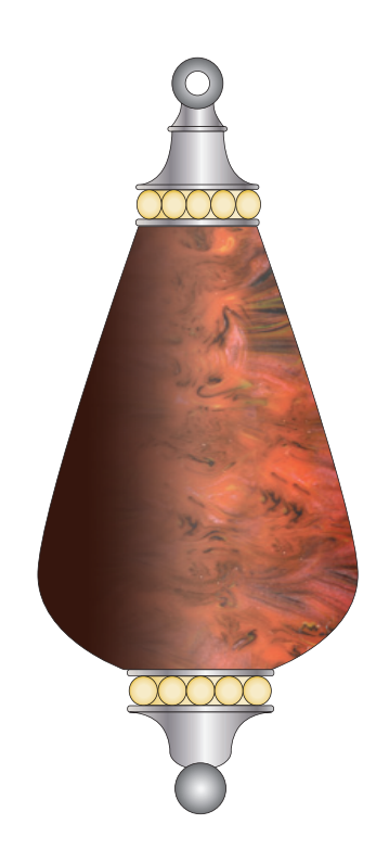
DIAGRAM A / Parts list