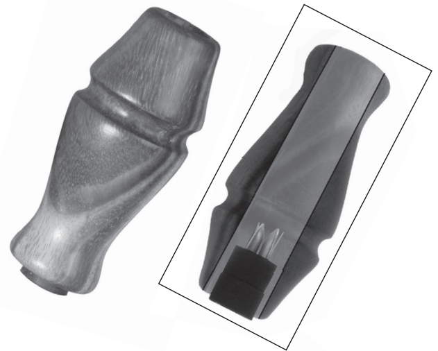
DIAGRAM A / PART LAYOUT